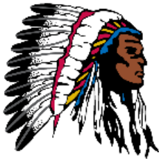
Osoyoos Indian Band