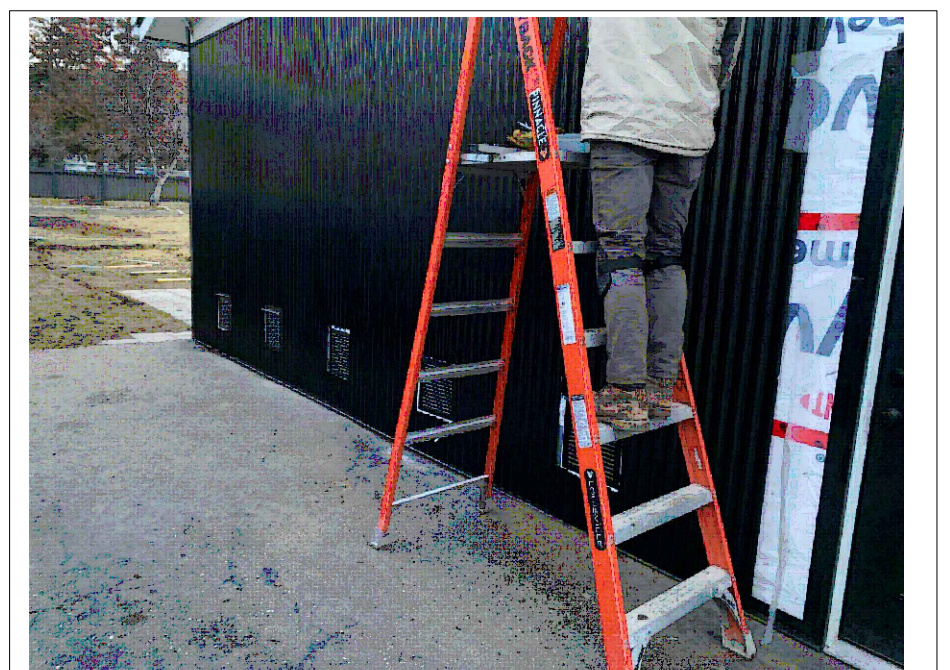
North Side - 2 Passive Vents