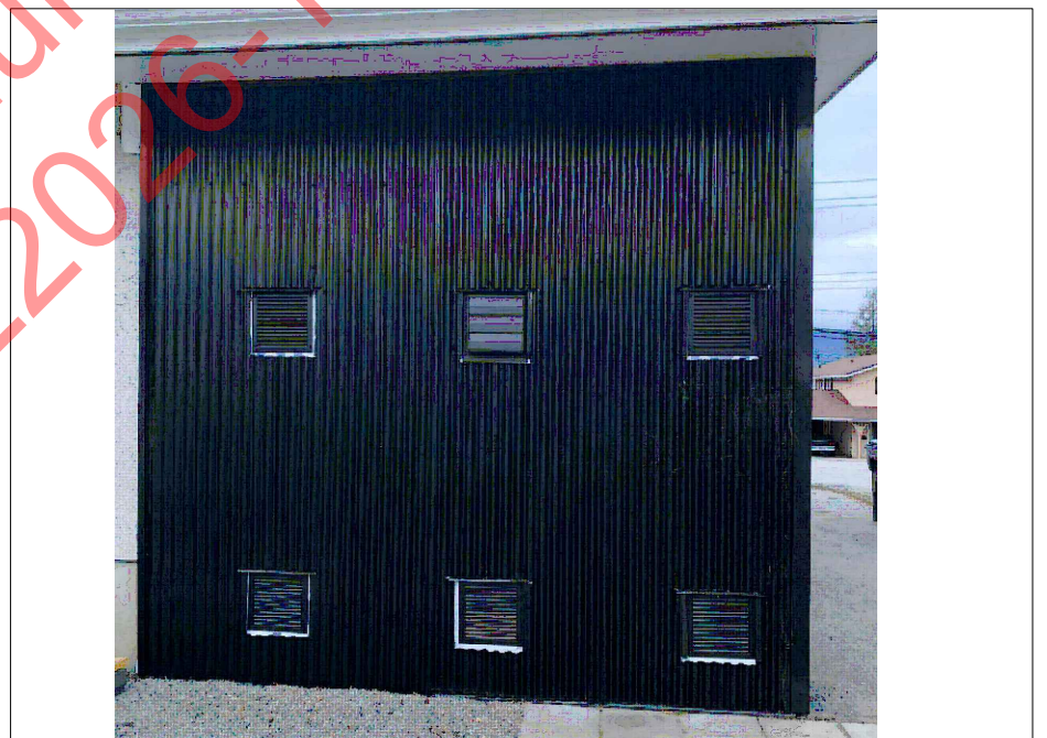
East Side - 5 passive vents, 1 active