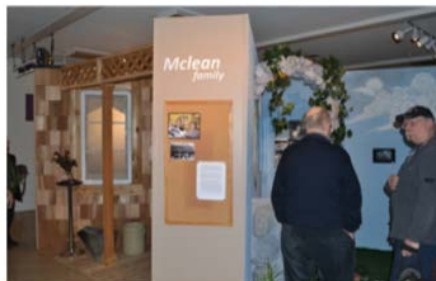
Temporary & Permanent Exhibits