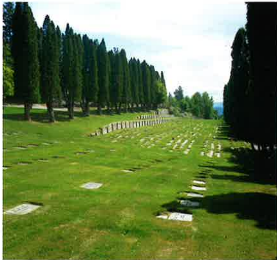
Tree-lined, in-ground plots