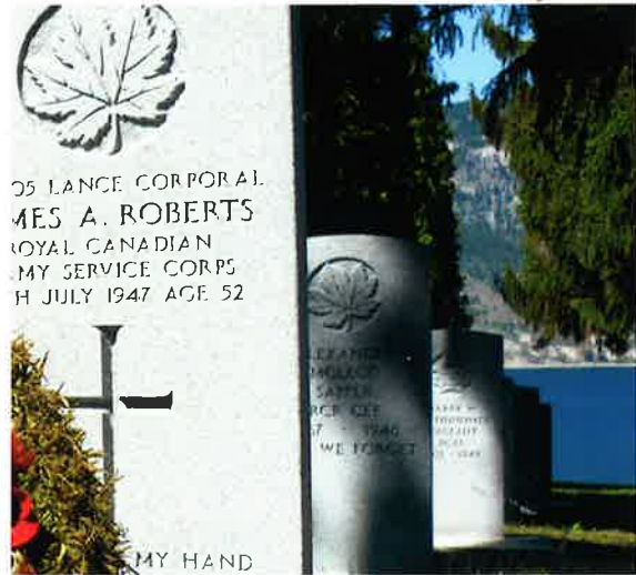
Veterans', Upright Marker Section