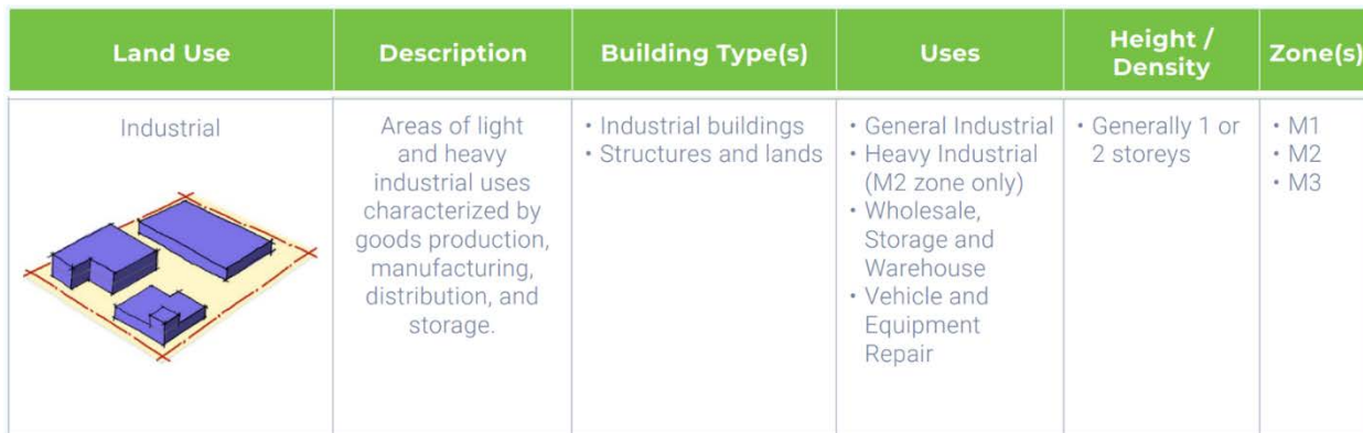
Figure 2 - Industrial Designation from OCP

Staff consider that the proposed zoning amendment from M3 (Wrecking Yard) to M1 (General Industrial) is well aligned with the OCP land use designation. The proposal is also aligned with the following OCP policies: