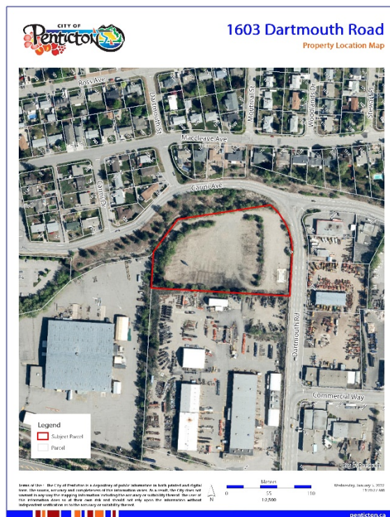
Figure 1 - Property Location Map

The subject property (Figure 1) is located at the corner of Carmi Avenue and Dartmouth Road, within the industrial area of the City. The subject property is approximately 4.3 acres in size and is currently zoned M3 (Wrecking Yard) and designated by the Official Community Plan (OCP) as Industrial. The property is surrounded by other industrial zoned properties (primarily M1) with residential uses to the north, across Carmi Ave. The property is currently vacant of permanent structures and minor works have commenced to prepare the site for future development.