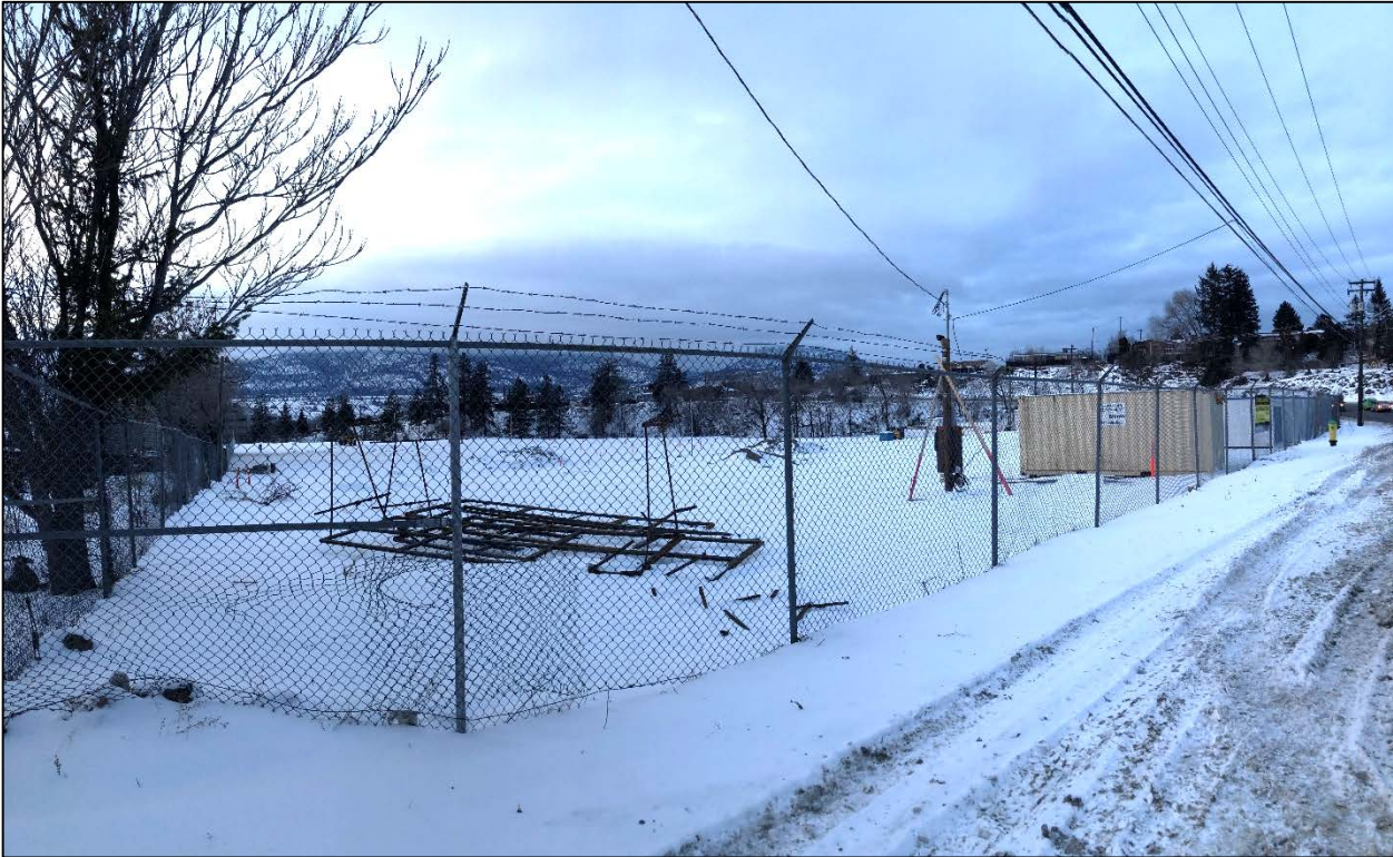
Looking at subject property from Dartmouth Road